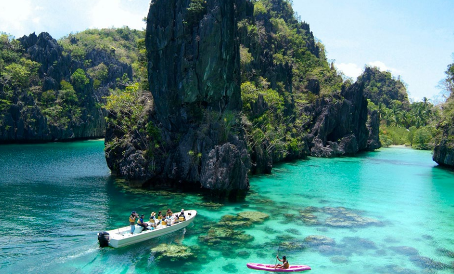
El Nido Palawan, Philippines

*All forms of fees & charges subject to change.